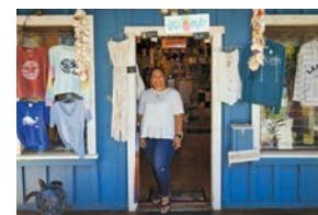
Feel the aloha in the inviting, tight-knit community of Lānaʻi City.