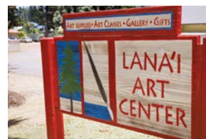
The Lānaʻi Art Center is a non-profit offering arts and cultural experiences for all residents and visitors through ongoing classes, workshops and studio access.