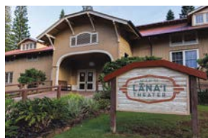
Enjoy a matinee at Lānaʻi's newly renovated historic theater, Hale Keaka.