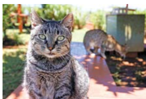
The Lānaʻi Cat Sanctuary is a 3.5 acre purr paradise, giving feral cats a home while also protecting the island's many endangered birds. Visitors are welcome daily.